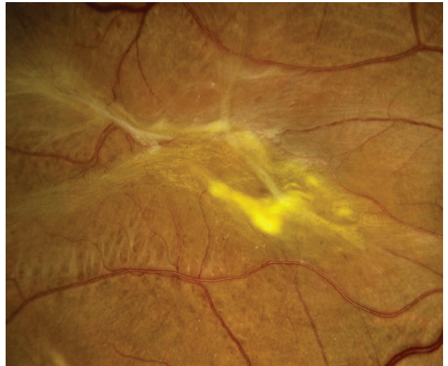
Figure 2 Epiretinal Membrane