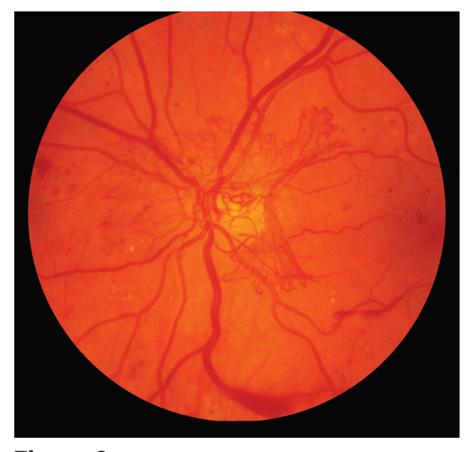
Figure 2 Retinal fundus photo of a patient with proliferative diabetic retinopathy. © ASRS Retina Image Bank, 2012. Image 774. Michael P. Kelly, FOPS, Duke University Hospital.

As the dye circulates, the physician takes pictures of the retina to accurately detect blood vessels that are closed, damaged, or leaking fluid. The pictures are black and white to help the doctor detect these changes more easily, but the process does not expose you to