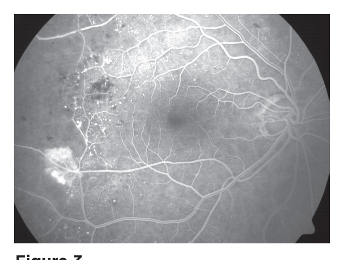
Figure 3 FA of a patient with proliferative diabetic retinopathy, retinal capillary nonperfusion, and neovascularization. ©ASRS Retina Image Bank, 2012. Image 2305. Sharon Fekrat, MD, FACS. Duke University Eye Center.