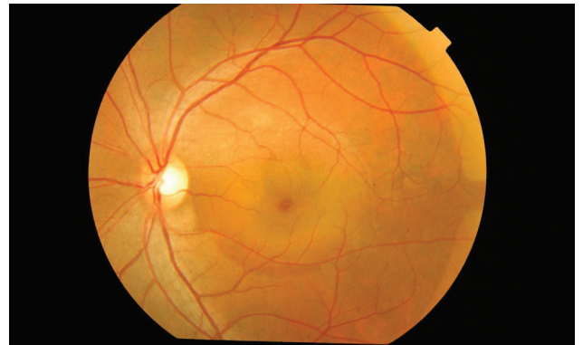
Color fundus photograph of left eye of a 33-year-old man with bilateral CSC. Mallika Goyal, MD, Apollo Health City, India. Central serous chorioretinopathy. Retina Image Bank 2012; Image 2117. ©American Society of Retina Specialists.

An association has also been made between CSC and patients with emotional distress and/or “type A” personalities. It is possible that the body produces natural corticosteroids in times of stress that may trigger CSC in an individual prone to this condition.