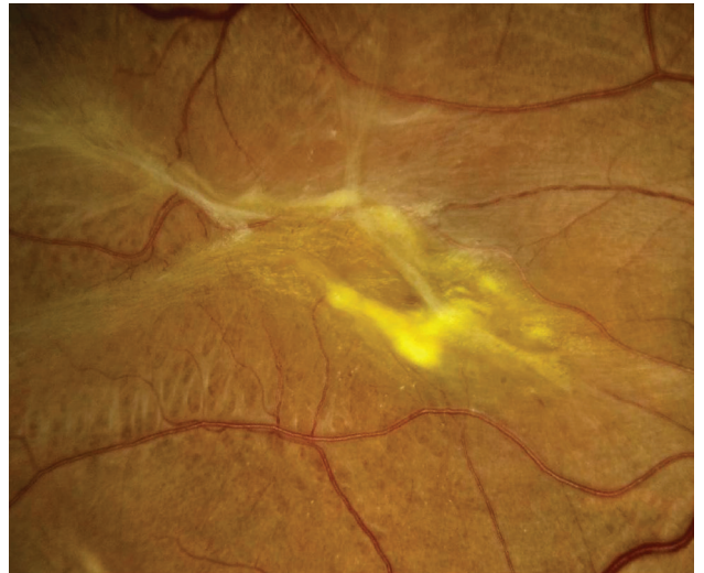
Figure 2 Epiretinal Membrane